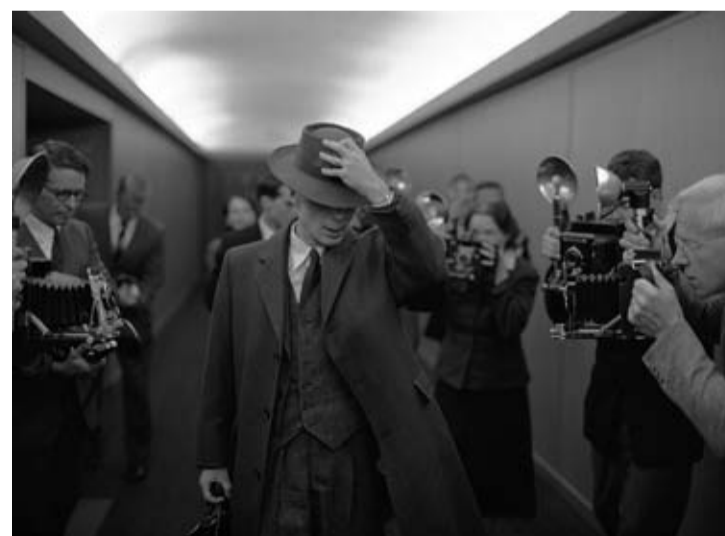
This image released by Universal Pictures shows Cillian Murphy as J. Robert Oppenheimer in a scene from the film "Oppenheimer," written and directed by Christopher Nolan.

the use of CGI. He also said it's one of the most challenging projects he's ever undertaken. □